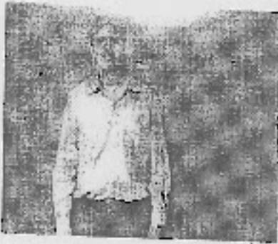
1st Party नासबर्त

Reg. No. 3580 Reg. Year 2010-2011 Book No. 4