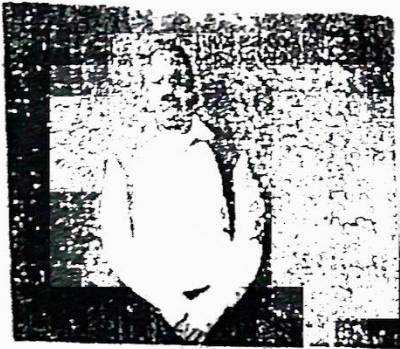
Ist Party न्यासकर्ता

Reg. No. 1154 Reg. Year 2010-2011 Book No. 4